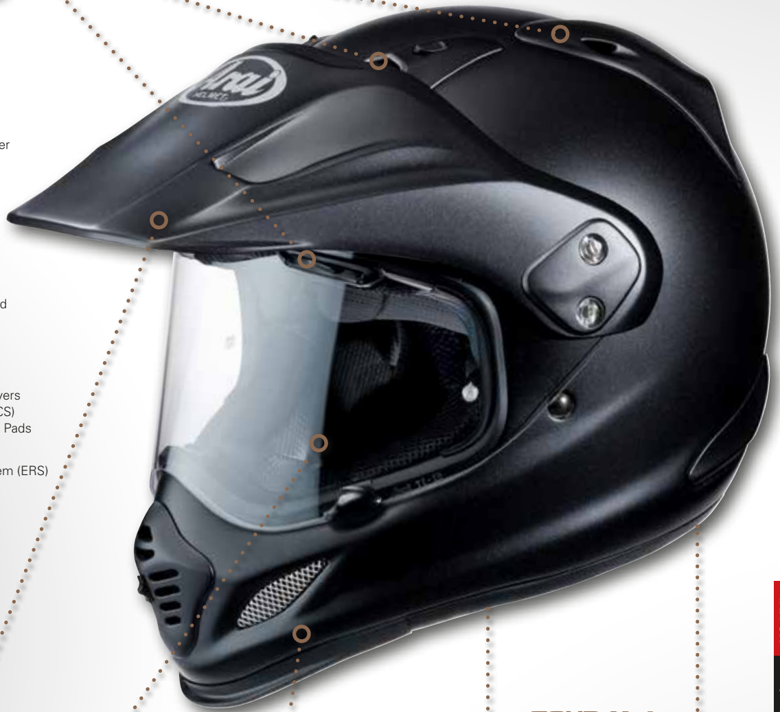
TOUR-X 4 Frost Black

** Innovated and exclusively offered by Arai